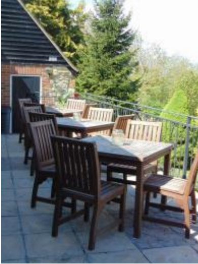
Terrace Seating Area