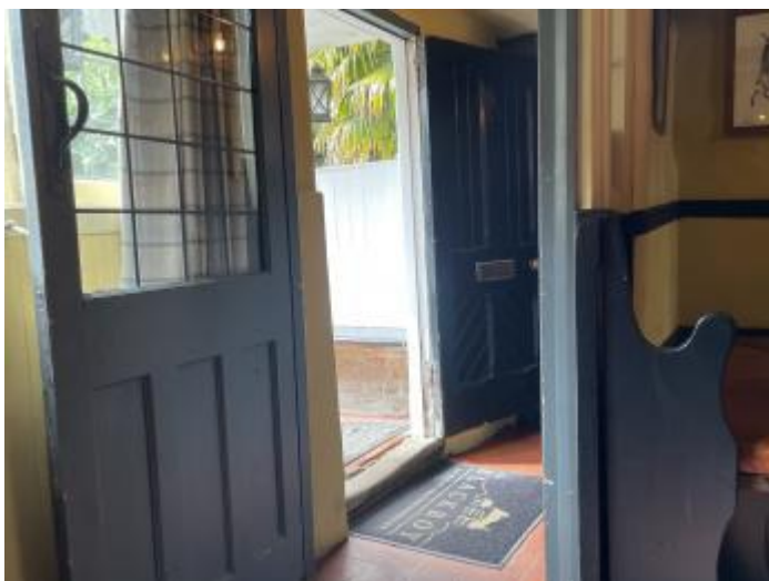
Small Step Down At The Main Entrance