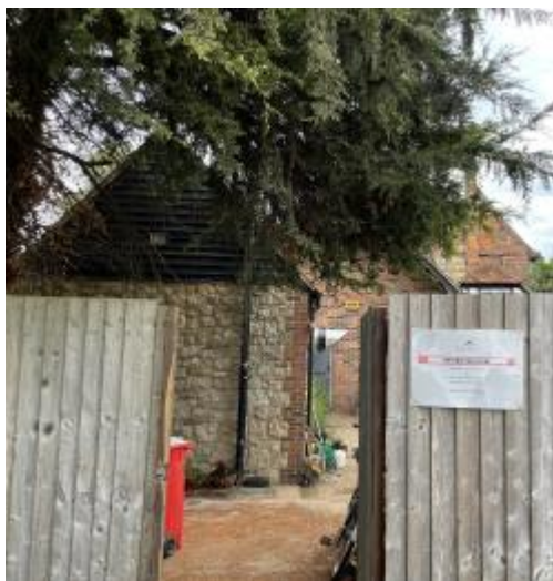
Rear Gate Access Point For Those With Mobility Restrictions