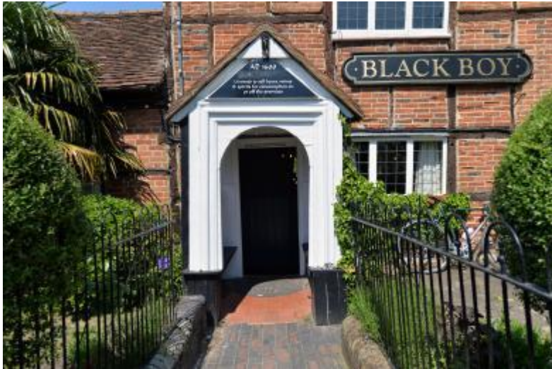
The Main Entrance