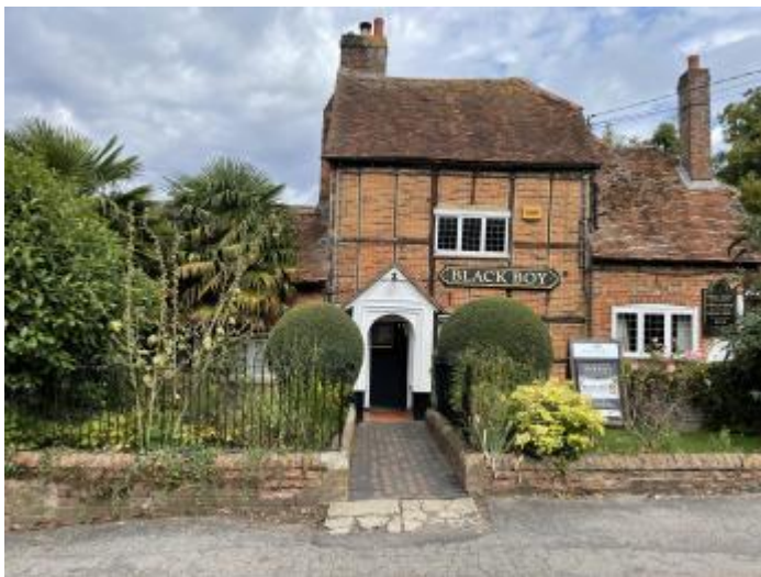
Broader View Of The Main Entrance